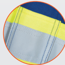
Tough double-stitched seams