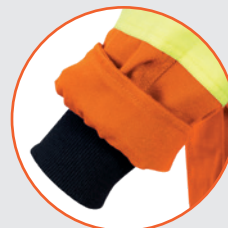
aramid storm cuffs