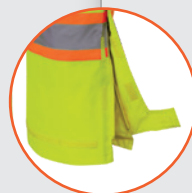
2-way 28" leg zippers for ventilation and easy boot access