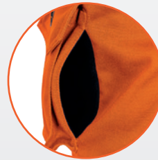
Fleece hand warmers