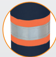
2" double-sewn premium StarTech® reflective tape