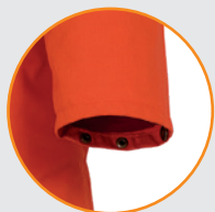
Adjustable snap wrists